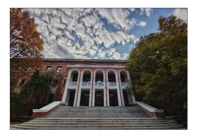
Figure 3. "Petru Poni" Institute of Macromolecular Chemistry, Iaşi, Romania